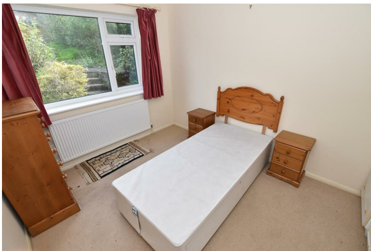
Garden approx 70' (approx 21.34m)